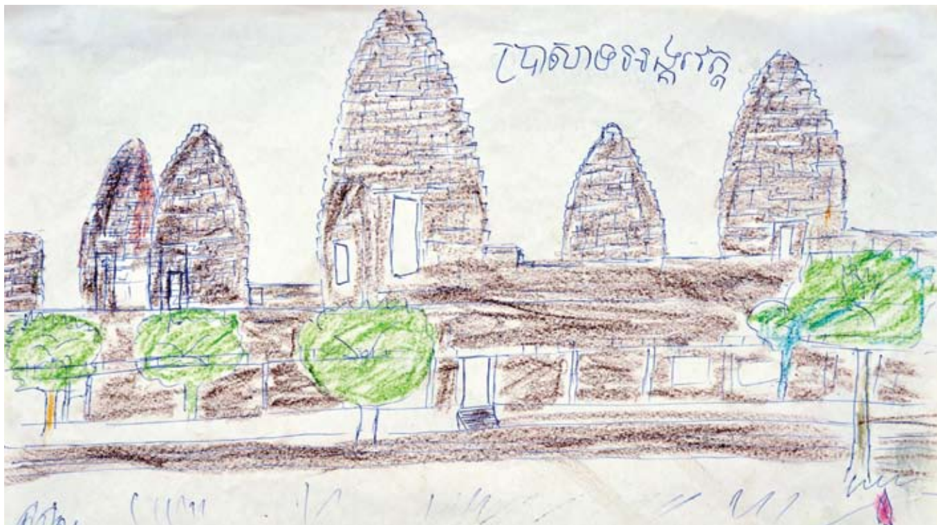
Angkor Wat Temple